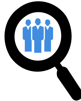
~40,000 participants: with a checking or saving account at a bank